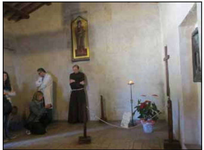
The corner of the Monastery where St. Clare of Assisi died

This place is also sacred to Franciscan nuns because a great woman of Assisi named Clare lived, and died, in the small monastery attached to this church, where she had founded the “Poor Clares.” The spot where she died is marked with a very simple sign stating: Clare of Assisi, 11 August 1253. This place reflects the simplicity with which these holy people lived.